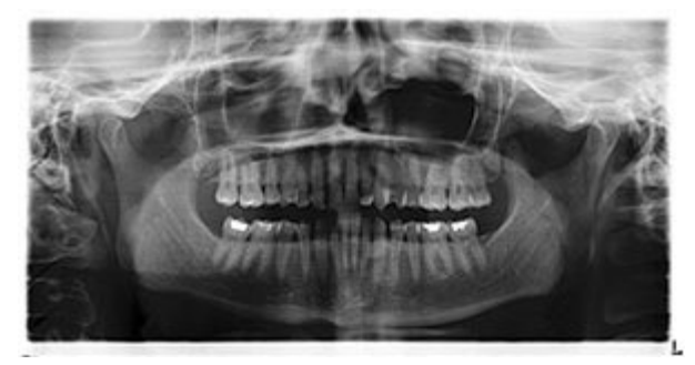
Figure 4. The pre-op radiograph revealed a minimally restored dentition with good bone levels.

One of the aesthetic challenges was to create uniform interproximal papilla height bilaterally because the interproximal bone height on the implant and the distal of tooth No. 8 were more cervical than on the contralateral side. The bone levels could be made more symmetrical by orthodontically extruding tooth No. 8, which would bring the interproximal and facial bone down further incisally. However, this would necessitate the removal of incisal edge tooth structure to satisfy the proposed smile design. After a discussion with the patient, it was decided that the tissue height differences were not noticeable enough to justify adding biomechanical risk by removing tooth structure from tooth No. 8.