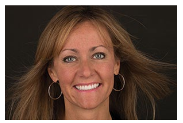
Figure 15. A beautiful result and a happy patient!

Detailed communication with the dental laboratory team is critical to successfully implementing the initial smile design. Excellent photo and video documentation enables the lab technician to "see" the patient and evaluate soft-tissue variables, such as lip dynamics and lip closure paths. The records taken and sent to the laboratory team (Smile Designs by Rego in Santa Fe Springs, Calif) included a Face-Bow (Panadent), upper and lower full-arch vinyl polysiloxane (VPS) impressions (Aquasil Ultra [Dentsply Sirona]), a bite registration (Futar D Fast [Kettenbach LP]) in maximal intercuspal position (MIP), a digital measurement of one tooth to cross reference with the lab models, and a stick-bite to verify cross-mountings (Figure 7). The technician understood that no-prep/minimal-prep veneers were planned. After evaluating the mounted models, the technician and clinician discussed that a slight reduction in the cervical third of tooth No. 11 would be necessary to accommodate the path of insertion. The wax-up was then created to reflect those clinical parameters, and a Sil-Tech Putty (Ivoclar Vivadent) stent was created over the wax-up. Feldspathic porcelain would be used to fulfill the aesthetic goals and the minimal-prep requirement.<sup>3</sup>