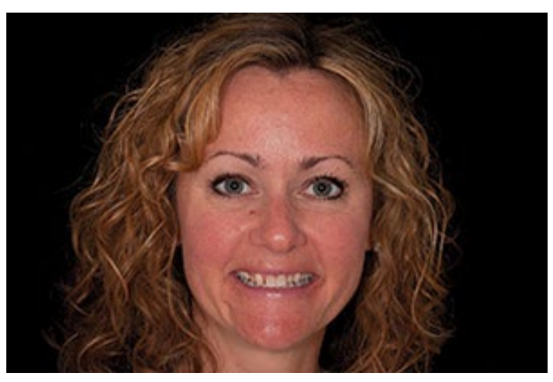
Figure 1. The preoperative photo shows the aesthetic challenges that presented with asymmetrical tooth shapes, color, and spacing.

At the initial examination, this 47-year-old patient desired to change her smile but was apprehensive about what would be involved (Figure 1). She worried that aggressive dentistry would be necessary to solve her problems. She was congenitally missing tooth No. 7. As a teenager, tooth No. 6 had been orthodontically moved into the lateral incisor position. The upper right primary cuspid was present distal to tooth No. 6, and tooth No. 10 was a peg lateral. A previous dentist had placed direct bonding on tooth No. 10 to close the interproximal spaces, but spacing continued to develop (Figures 2 and 3).