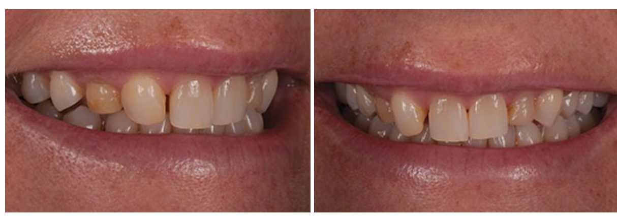
Figure 2. The tooth size discrepancy was noticeable in this pre-op photo.