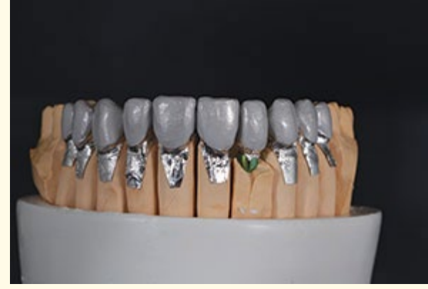
Figure C. The platinum foil was cut and then Figure D. Multiple layers of feldspathic adapted to the dyes.