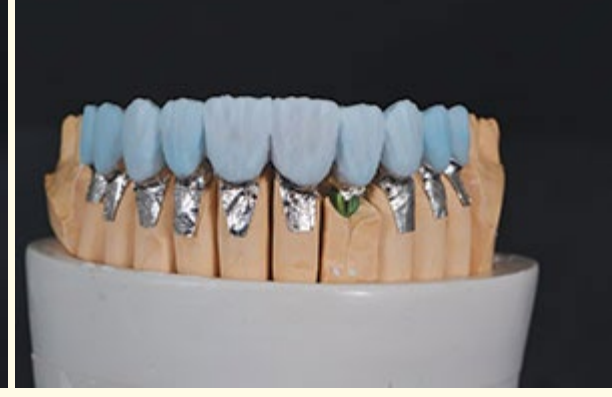
porcelain were applied to mimic the natural dentition.