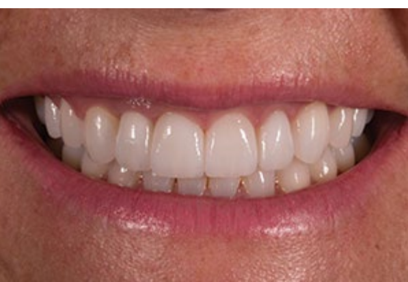
Figure 12. A close-up of the final smile.