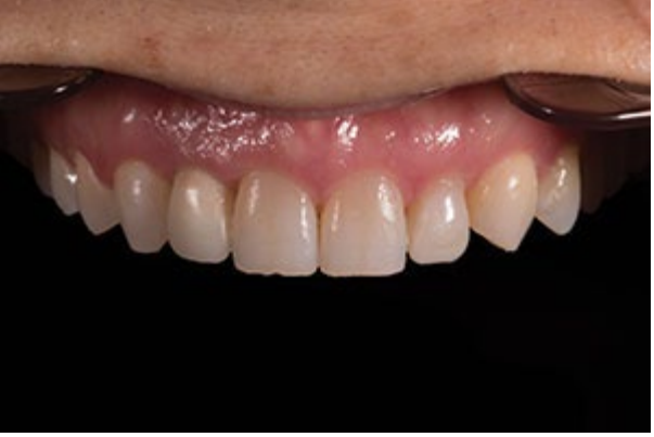
Figure 6. After orthodontics, the angulation and asymmetrical spacing had been corrected.