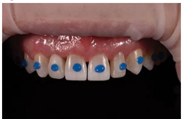
Figure 9. Spot-etching the teeth prior to placement of the provisionals.