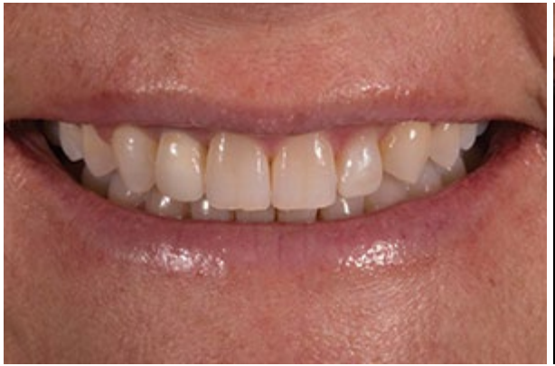
Figure 5. The provisional restoration on the implant for tooth No. 7.