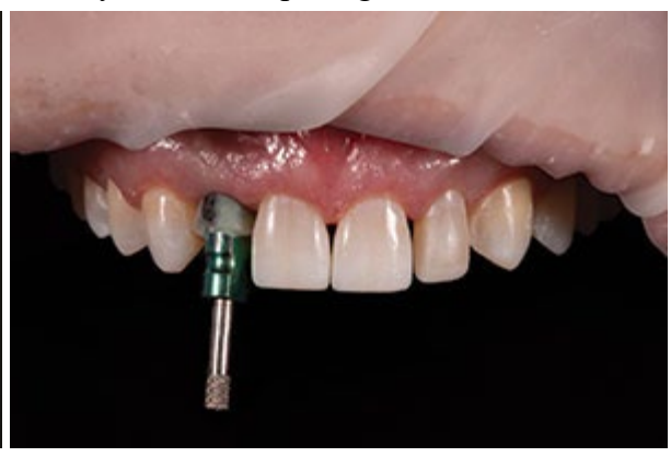
Figure 8. The custom impression coping in place for the final impression.