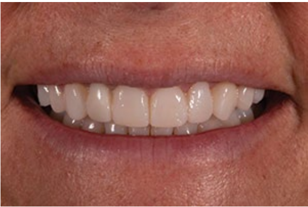
Figure 10. A close-up photo that was sent to the dental laboratory team for the creation of the final restorations.