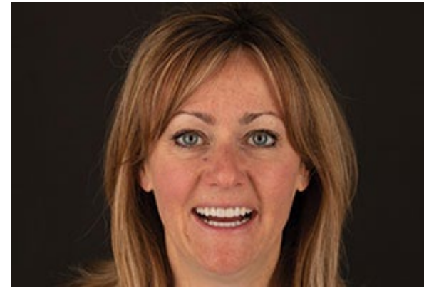
Figure 11. A photo illustrated any minor