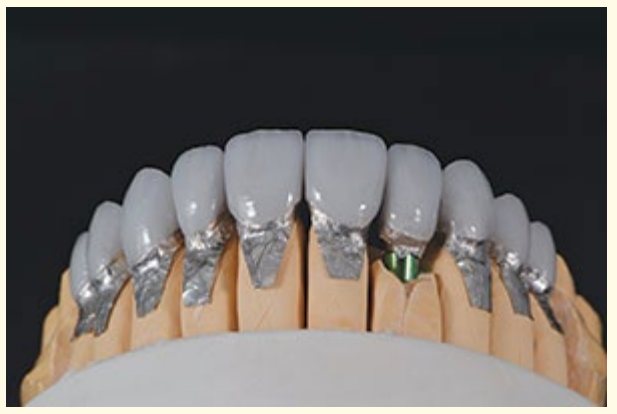
Figure E. The finished restorations (shown here just prior to the removal of the platinum foil).

The case was scanned for a Digital Custom TiBase using a D2000 3-D Scanner (3Shape) and an Atlantis