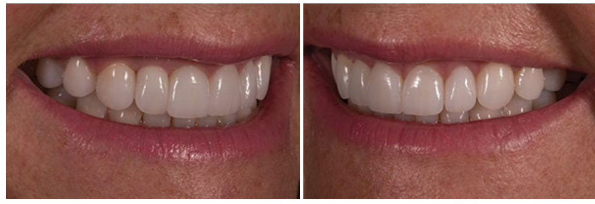
Figure 13. The successful restoration of the no-prep veneer adjacent to the implant crown. now harmonious with the right.

changes to be made in the final veneers.